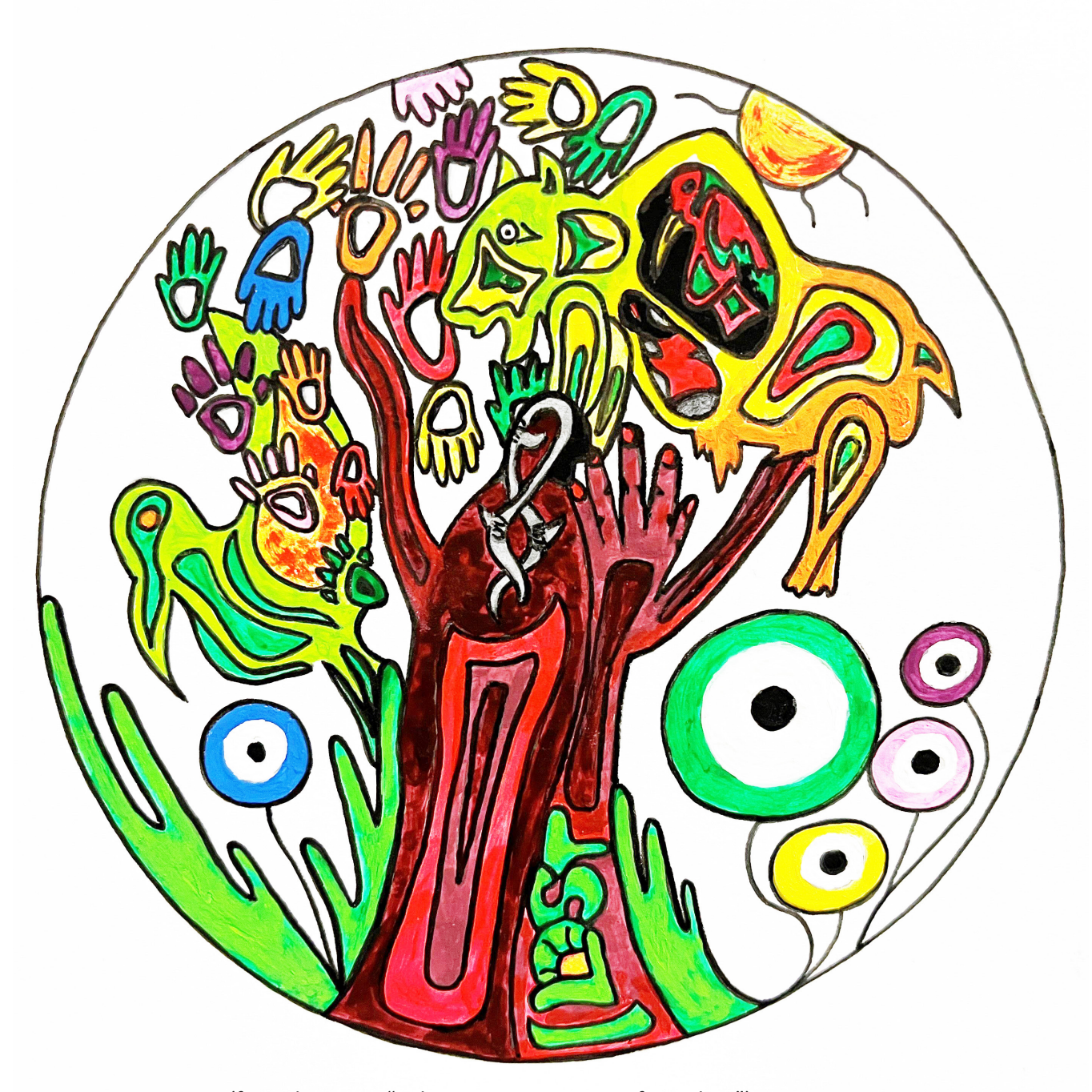
By Tara DeSousa, Cree (from the series "Indigenous Movements of Freedom")